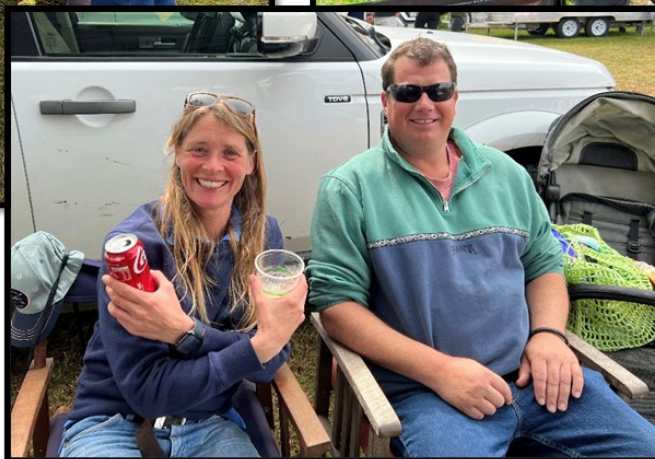
8. Merit and